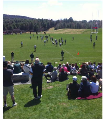
Rugby Match- Dartmouth VS Kutztown. Beautiful day but a tough loss for big D of 31 to 15.

Earlier we had a tailgate before the Rugby match with Kutztown.