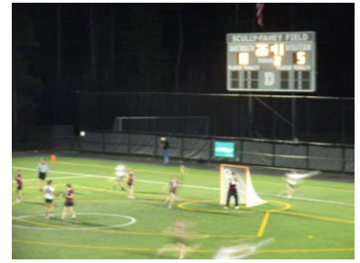
Harvard / Dartmouth women's lacrosse game

DCUV cosponsored with the Hill Winds Society (student ambassadors to the alumni body) two tailgate parties for athletic games this spring.