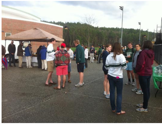
Barbecue before the Lacrosse games