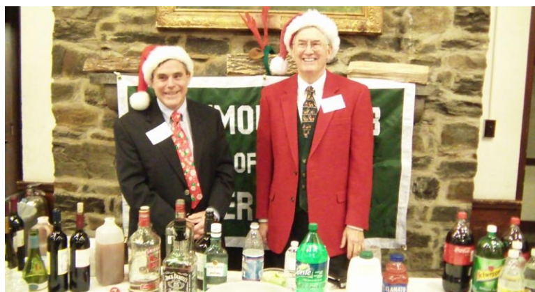
Our highly qualified bartenders serving at last years party

Tis the season to be jolly!! The Christmas Tree on the Green is lit and it's time for the DCUV Holiday Party, one of our signature events of the year. As you have already been advised, our holiday party - free for all members is December 11 (Tuesday) from 5:30 to 8:30. This year we are returning to the new '53 Commons (formerly Thayer Dining Hall). This gives us more room for socializing together in preference to the smaller rooms in the DOC House.