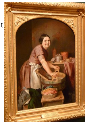
The Jolly Washerwomen

Was conducted by Hood Museum staff and docents. Our society has developed an educational model that serves our citizen's needs to read, write, count and compute, but which is not effective in developing the skills of looking at, seeing, describing, and interpreting visual images. "Learning to Look" created by the Hood Museum of Art is a five step approach designed to help viewers look carefully at and think critically about any work of art they encounter. One of the art works we studied was: