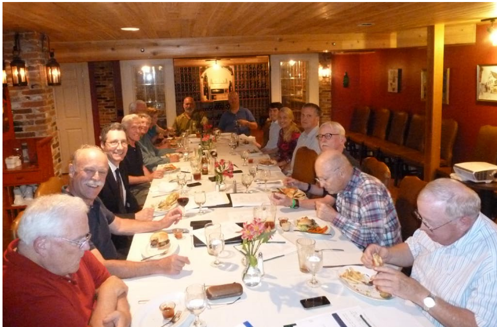
In June the newly elected board met for its annual planning meeting to work on policies and the schedule of events for the coming year.

dartmouth.org/clubs/dcuw/pictures/bookawards13