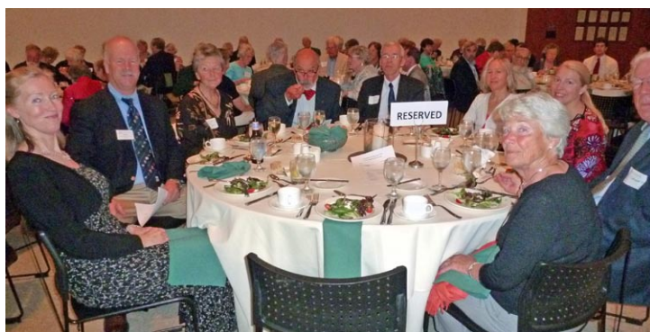
A table scene for our Annual Dinner