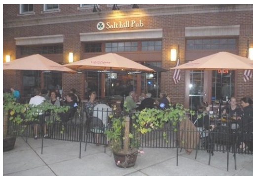
The Outside Patio at Salt Hill!

It was cosponsored by The Dartmouth Alumni Office for YADA and the DCUV. All attendees had a free drink with excellent appetizers - both inside and outside on the deck. It was a huge success with about 53 attending ranging from a '47 to '13s, and families with children (class of '26?) with a nearly 50/50 blend of YADAS and YAHAS.