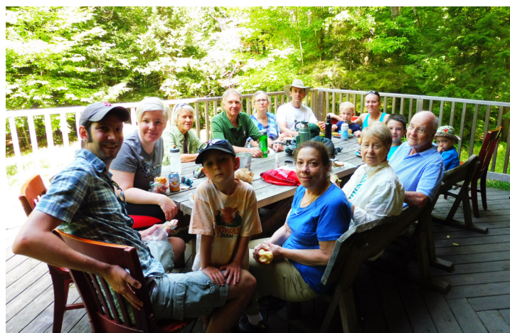
Most of us had a lunch around a big picnic table on the deck. Note the young pre Dart. children on the end.