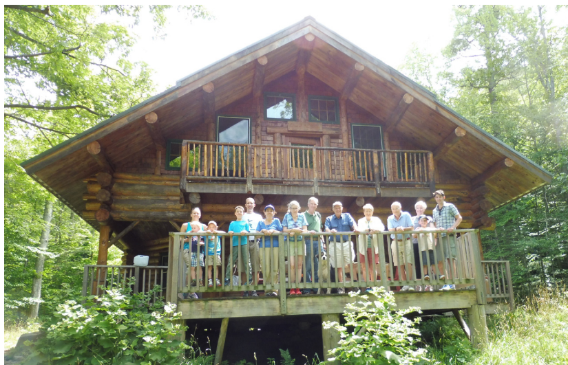
A view of the log structure lodge as you approach it.