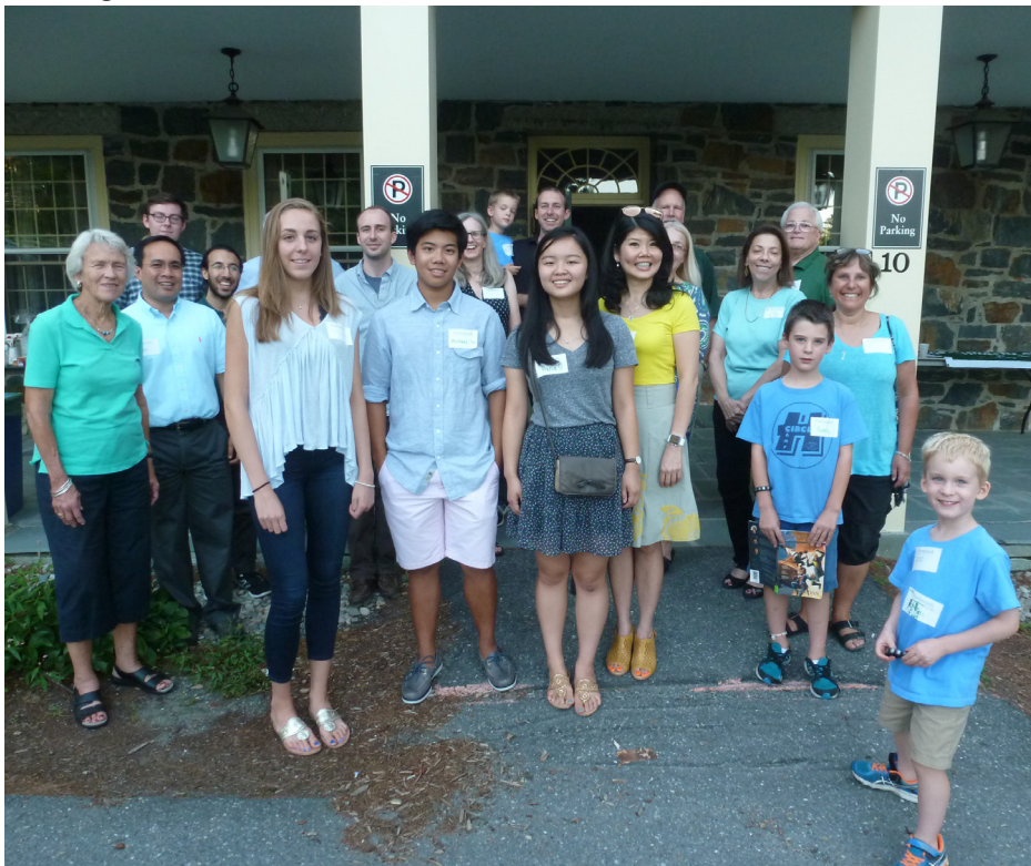
A group photo of the attendees at the gathering with the three new 2020 classmates standing in the front.