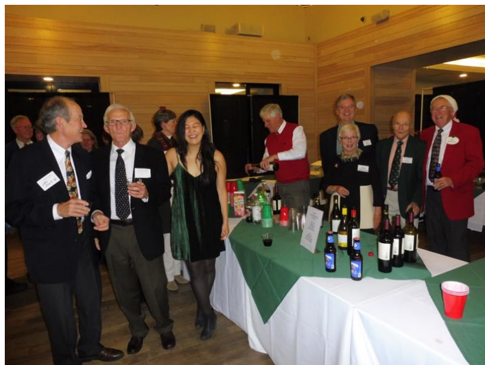
Our special wine, beer and soft drink bar with happy tenders!