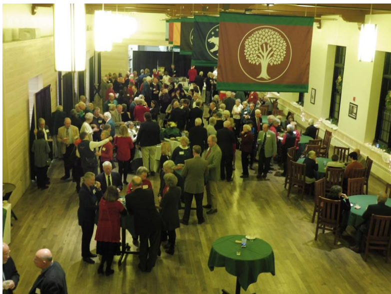
A view of the full group from the balcony

Many thanks to all members that brought a new children's book that we donated to local charities!